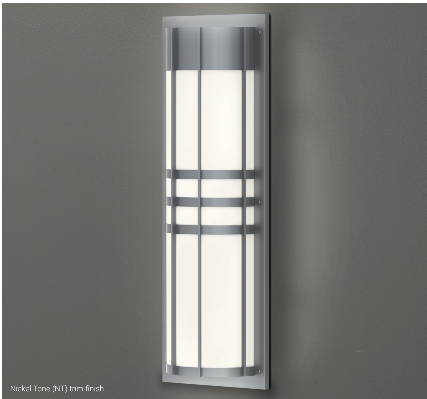
Nickel Tone (NT) trim finish