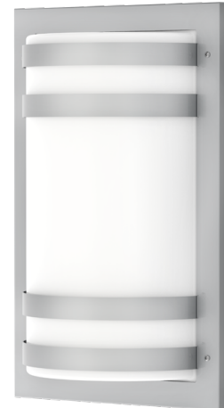
NT finish, VB0 trim