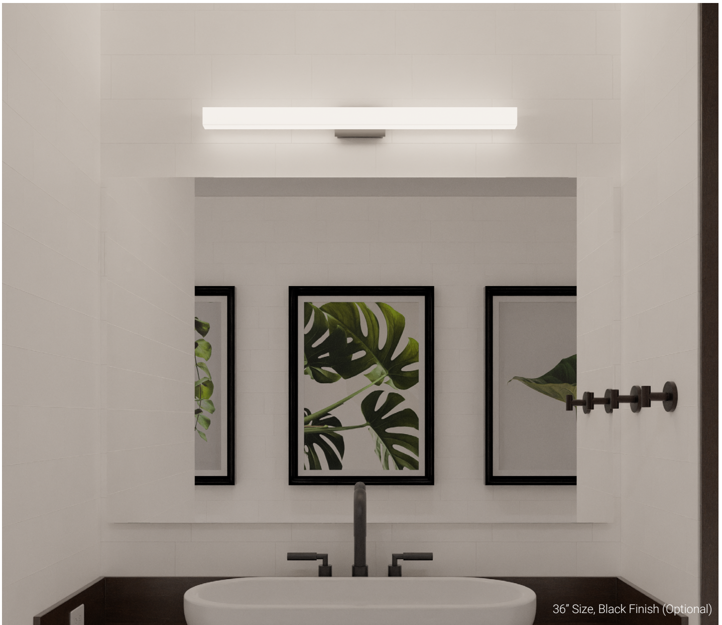
36" Size, Black Finish (Optional)