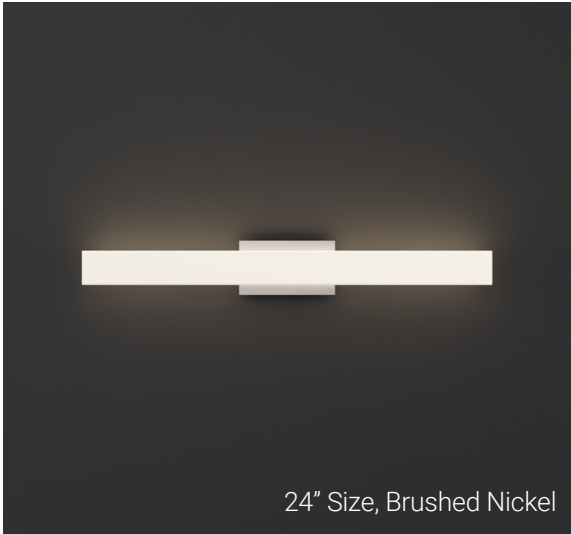
24" Size, Brushed Nickel