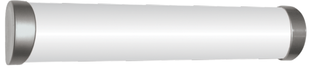
NT endcaps, WHA diffuser