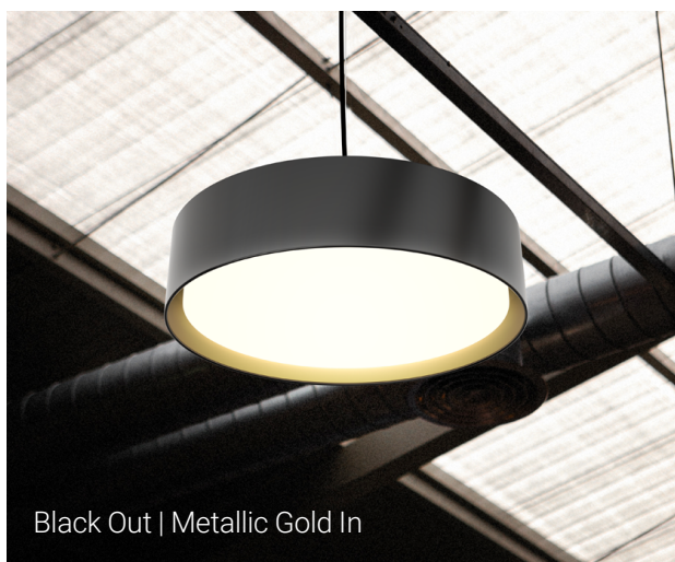
Black Out | Metallic Gold In