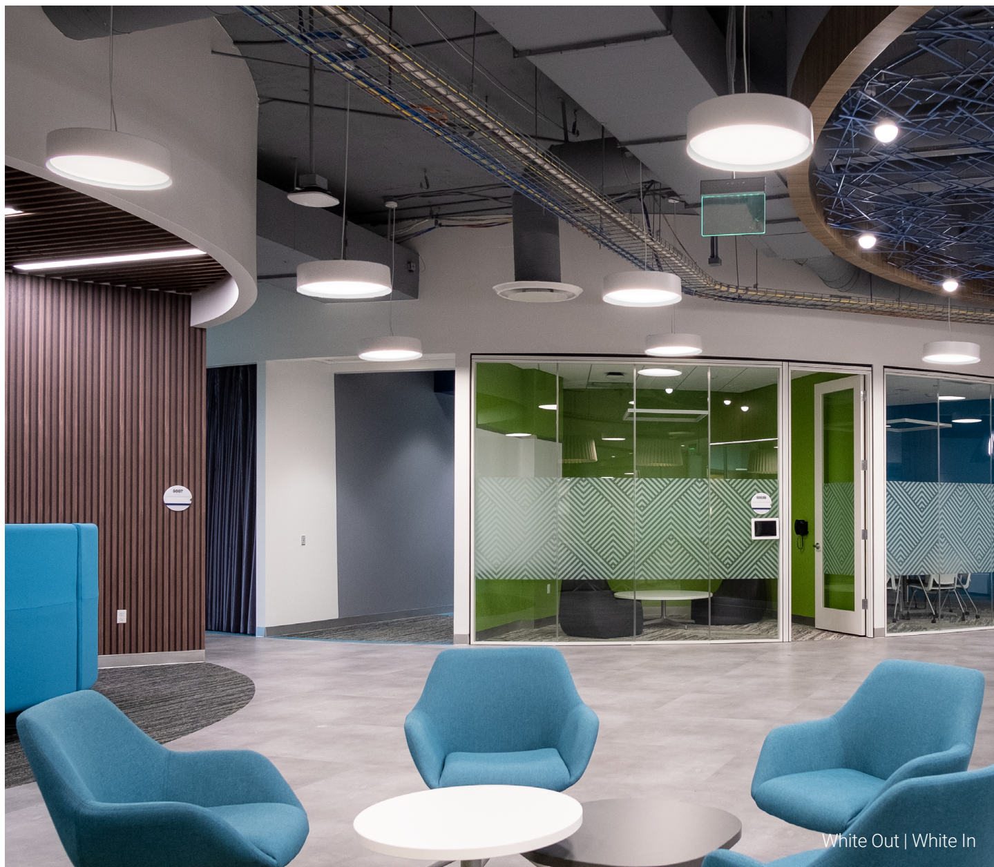
White Out | White In