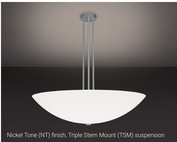
Nickel Tone (NT) finish, Triple Stem Mount (TSM) suspension