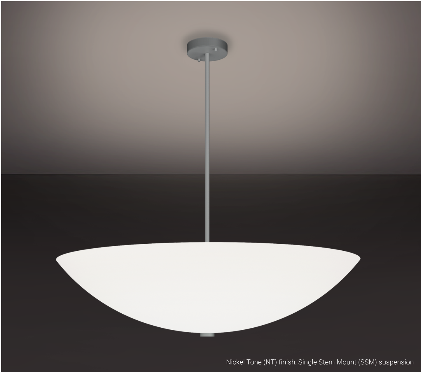
Nickel Tone (NT) finish, Single Stem Mount (SSM) suspension