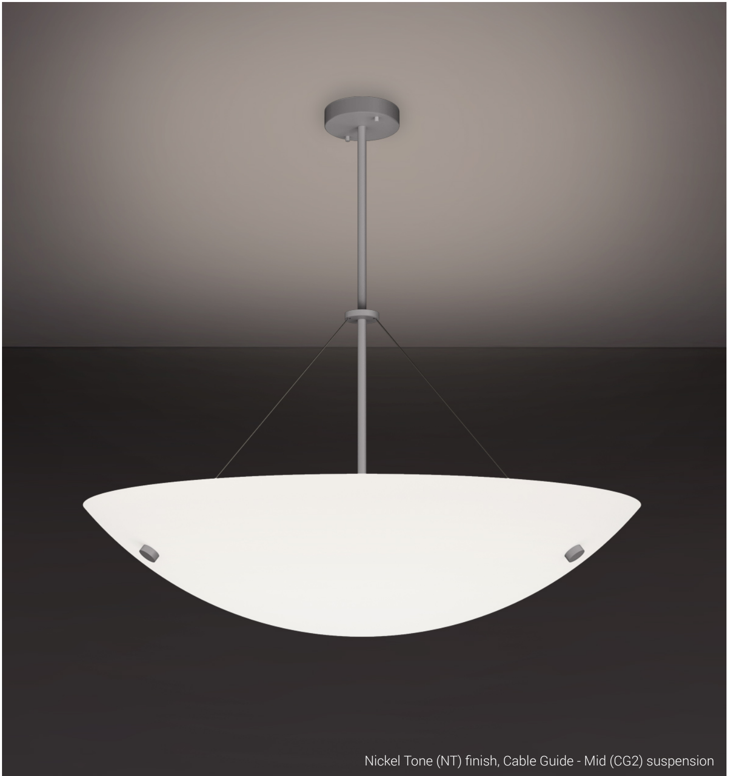
Nickel Tone (NT) finish, Cable Guide - Mid (CG2) suspension