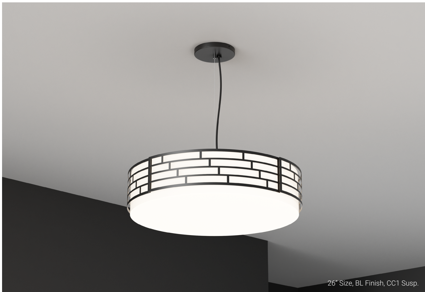
26" Size, BL Finish, CC1 Susp.