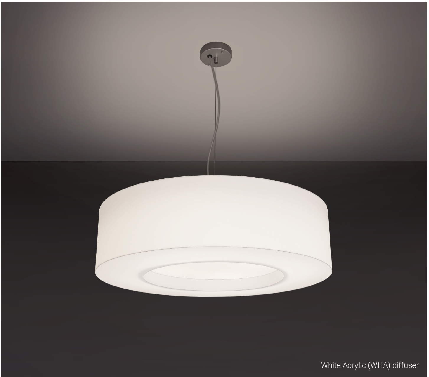
White Acrylic (WHA) diffuser