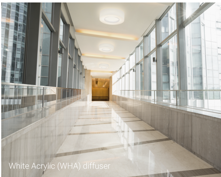
White Acrylic (WHA) diffuser