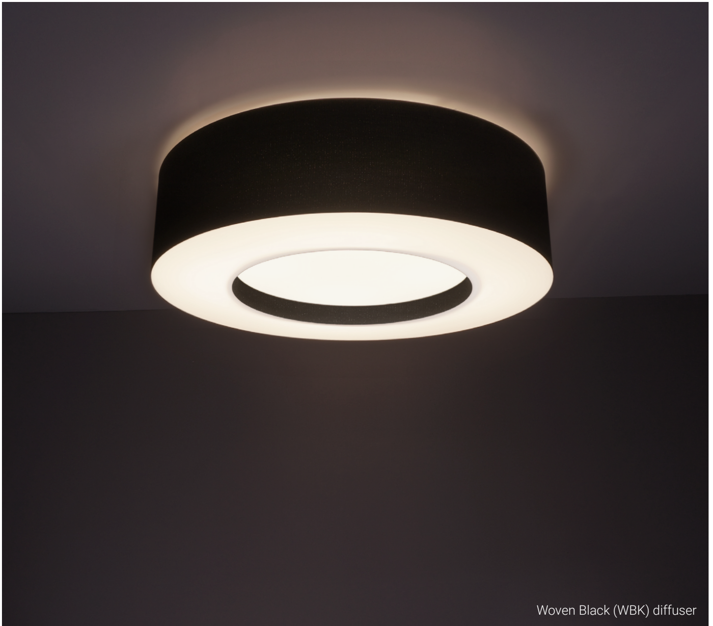
Woven Black (WBK) diffuser