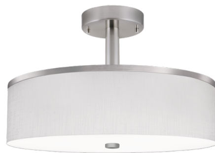
BN finish, WHL diffuser

90R 0 90 CRI (3000K only) BAC 1 Buy American Compliant (BAA) BLD 3** Bi-Level Dimming DTR 4 Triac (Line Voltage) Dimming (120V) FCL 7 French Canadian Labels OCC 8 Occupancy Sensor T24 9 Title 24 JA8 Compliant (B12 & C24 in 3000K only)