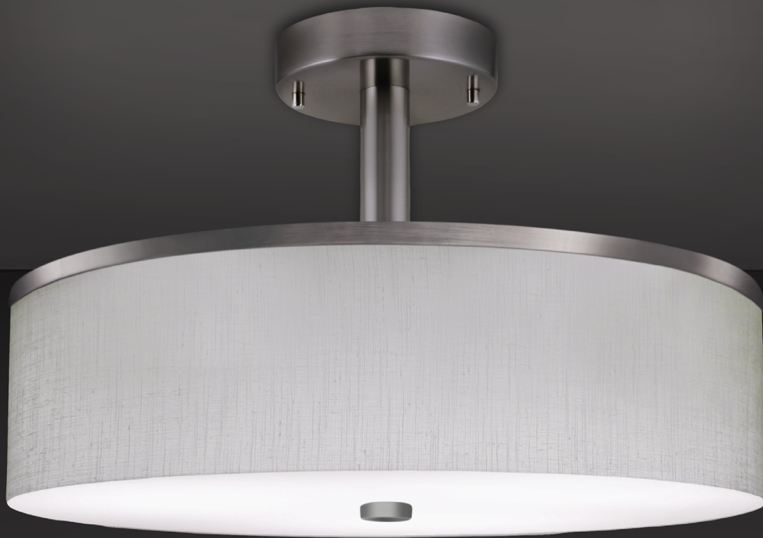
White Linen (WHL) diffuser