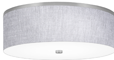
BN finish, GYL diffuser