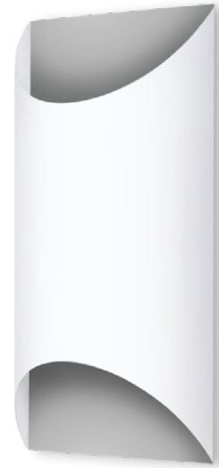
White Out | Nickel Tone In