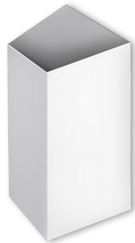
White Out | Nickel Tone In