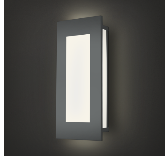
NT finish, WHA diffuser