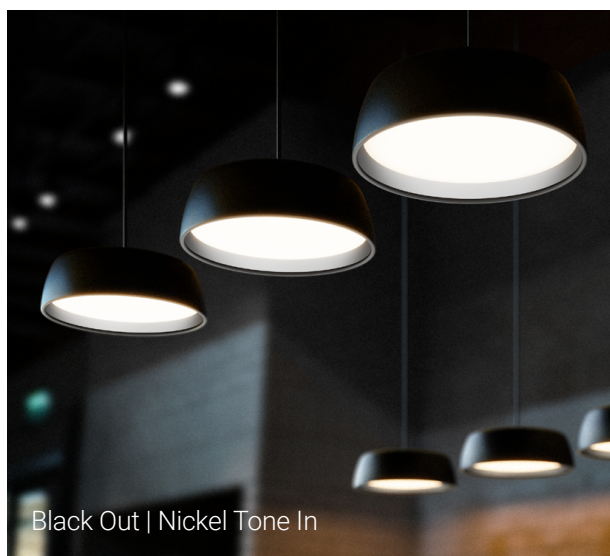
Black Out | Nickel Tone In