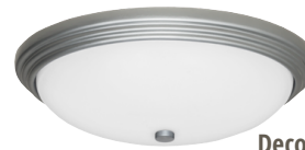
Decorative Finial Option