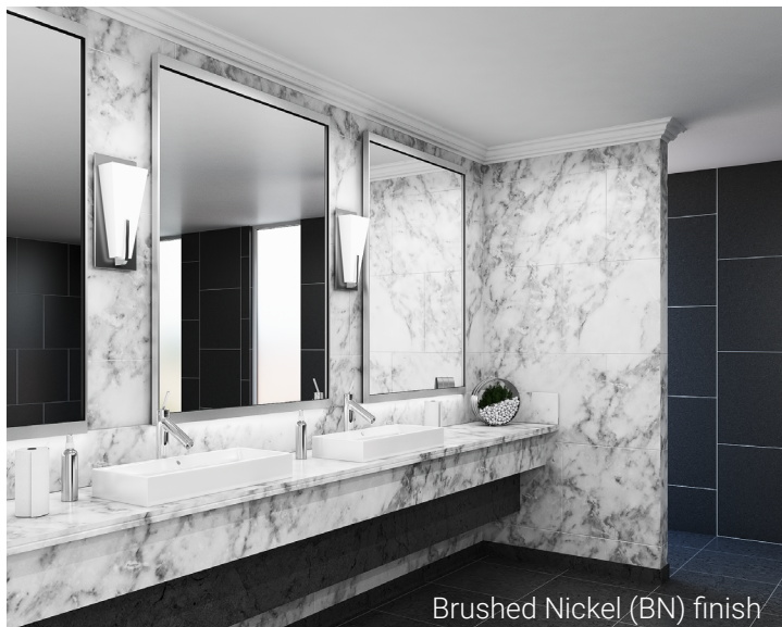
Brushed Nickel (BN) finish