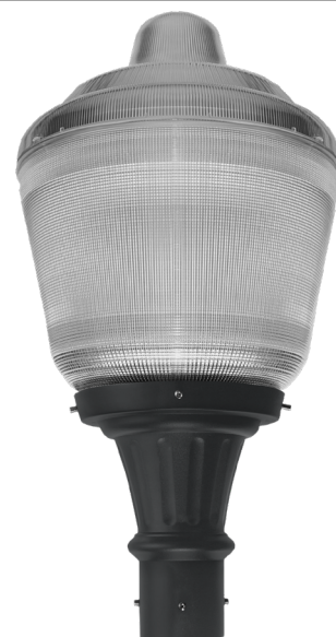
CPA5 diffuser, BL finish