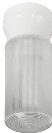
WH finish, CPA diffuser