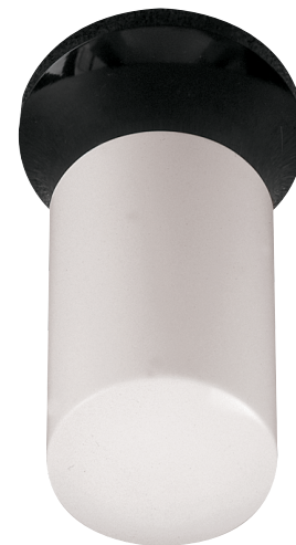
BL finish, WA diffuser