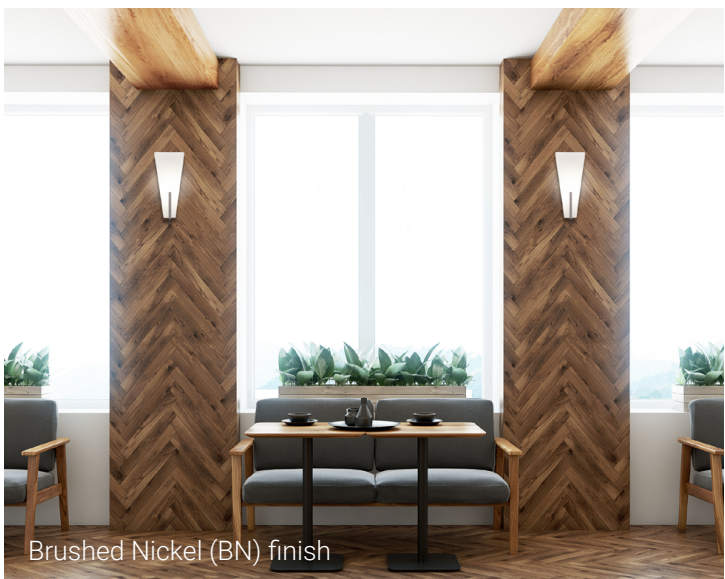
Brushed Nickel (BN) finish