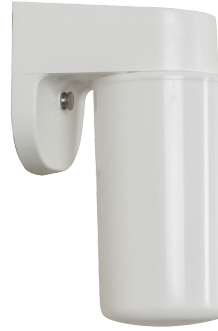
WH finish, WA diffuser