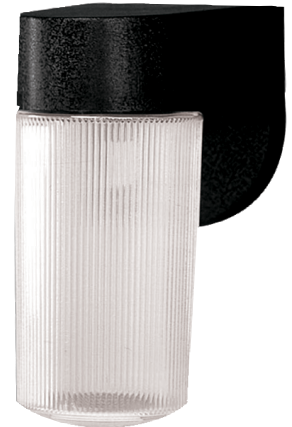
BL finish, CPA diffuser