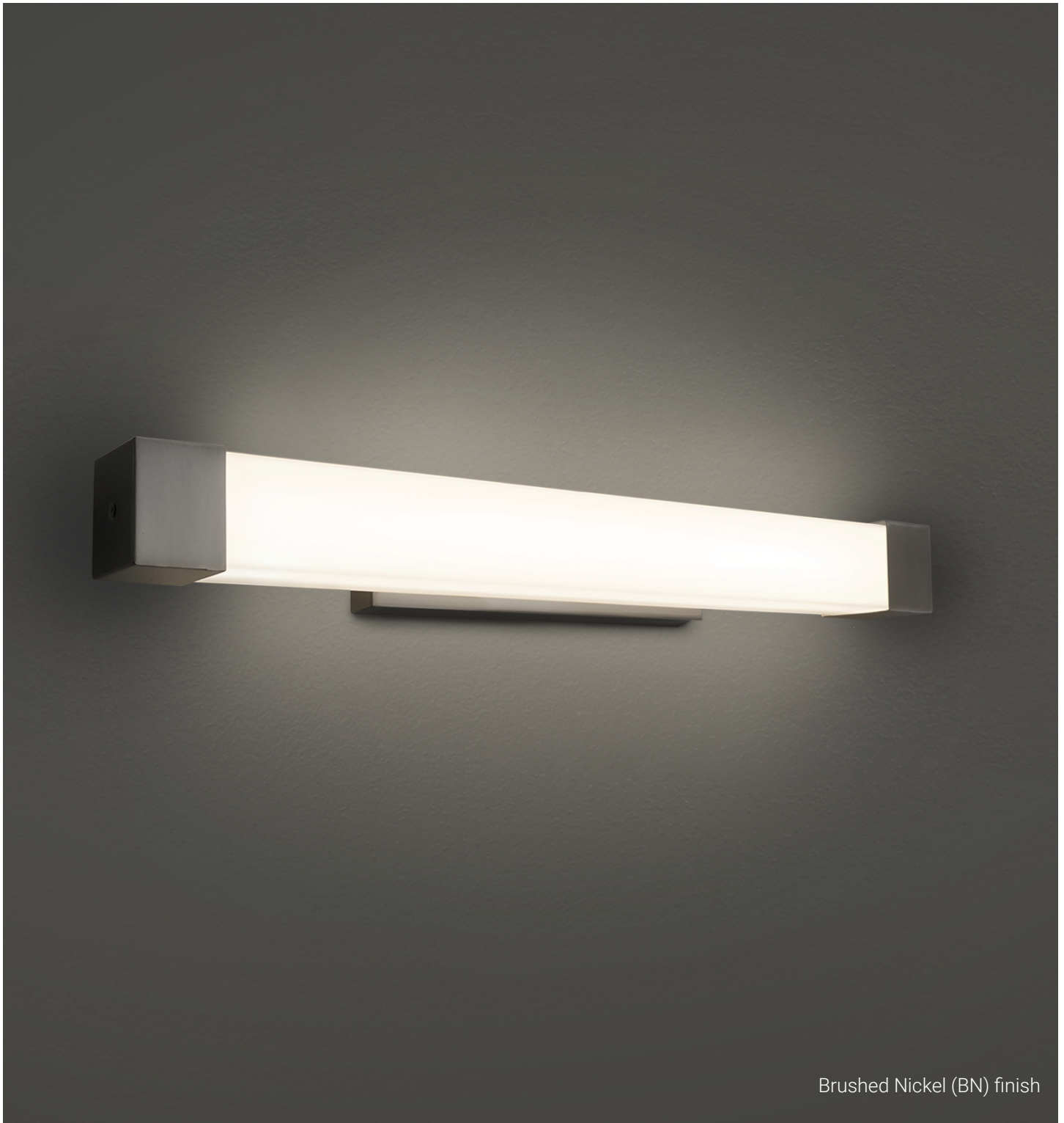
Brushed Nickel (BN) finish